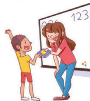
Our school redeems Scholastic Rewards for additional resources.