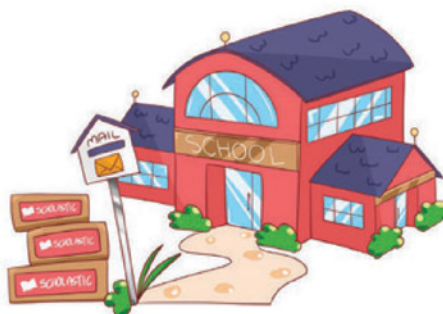
Our school earns Scholastic Rewards.