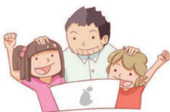
Families order from Book Club.